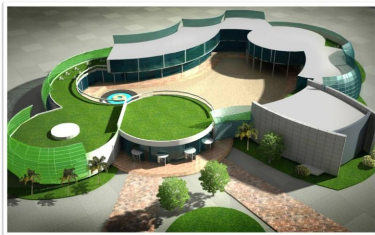
Figure 1 : 3d view of the building shows the main courtyard and the two envelop system.