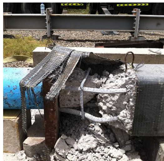
Figure 2 : A carbon FRP strengthened RC column after failure.